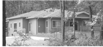
Sambodh Center for Human Excellence

In the quiet woodlands of Kalamazoo, MI, Sambodh Center for Human Excellence (SCHE) is quietly emerging as a major facility in the United States for the teaching of Vedanta, Meditation, Ayurveda and Yoga fostered by the Dharmic vision: the unity of all, and the unity of all spiritual paths. SCHE serves as the headquarters of The Sambodh Society, Inc. and is maintained by devotees, donors and friends.